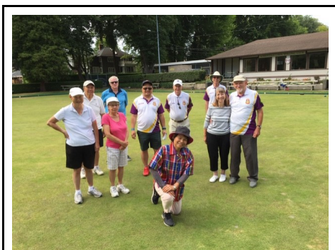
Last year's fun pairs

For a second consecutive season, the newly organized Tuesday morning moneymaker has been forced to cancel it's May start, following COVID-19 restrictions that continue to disallow any inter-club play from taking place.