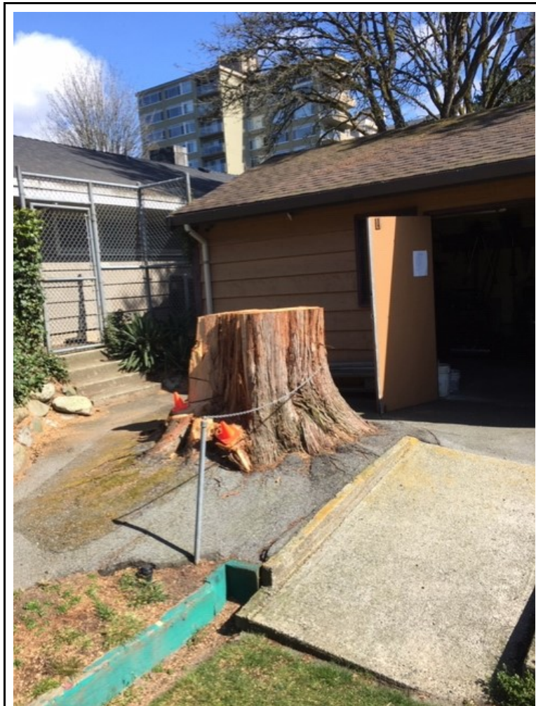
Repairs have been made from the March windstorm

Last year, if you remember, the club hosted an all-day pairs tournament for Kerrisdale members in August that was thoroughly enjoyable.