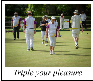
Triple your pleasure

Prior to this year's cancellation of the Elm Park Triples due to the COVID crisis, 16 club teams from the greater Vancouver area were signed up to play, including four from the host Kerrisdale club.