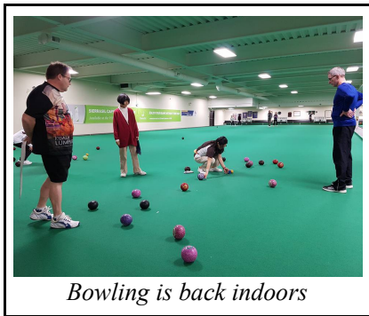
Bowling is back indoors

Vancouver's only indoor bowls facility is gearing up for a Sept. 8 reopening.